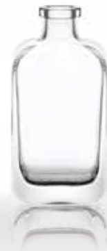
Supreme 100 ml