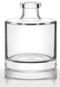
Revive 200 ml