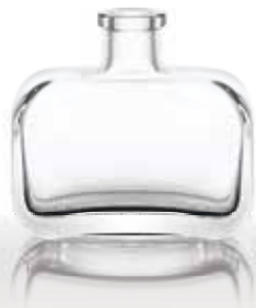
Baguette 100 ml