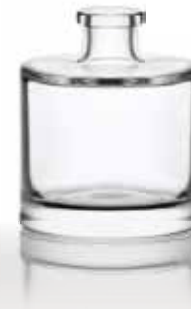
Revive 100 ml