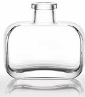
Baguette 200 ml