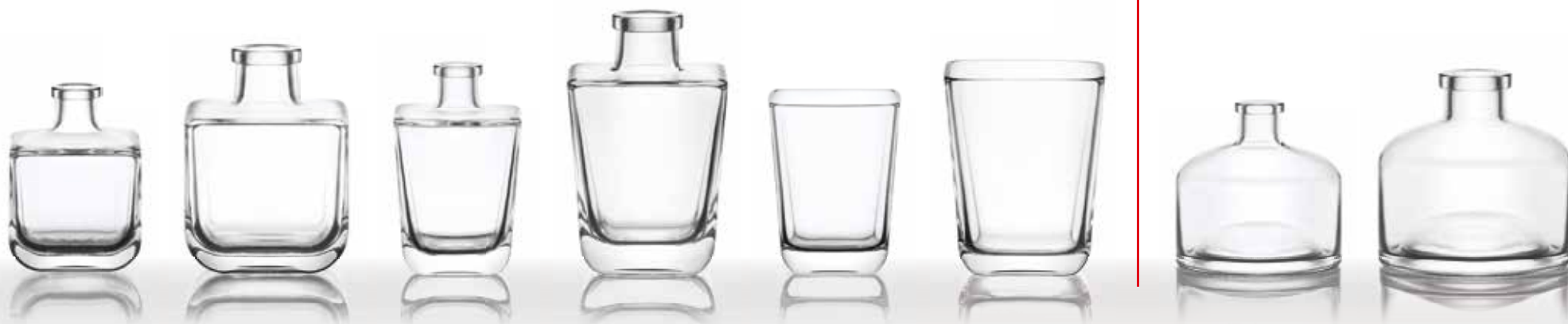
Cubic 100 ml