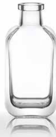
Supreme 200 ml