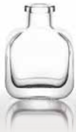
Classic 50 ml