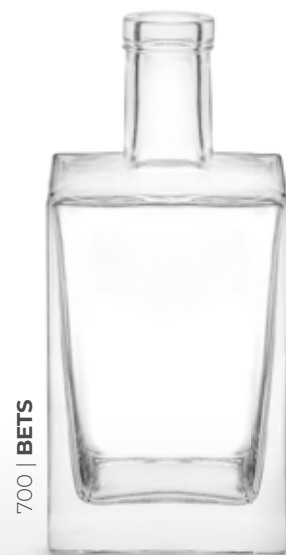
700 | BETS