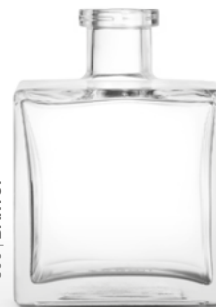
500 | BARTOP