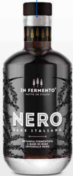
PACHO | 500 ML