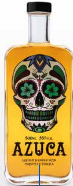
GARDI | 500 ML