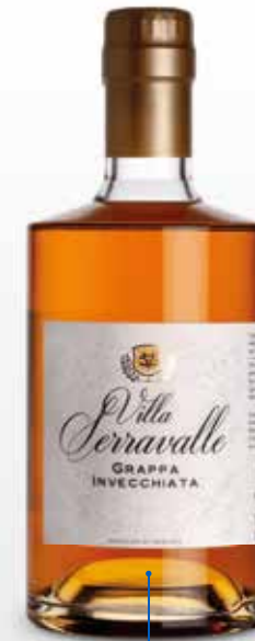
BELLEVILLE | 700 ML