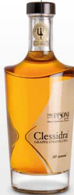
DECANTER LOLA | 700 ML