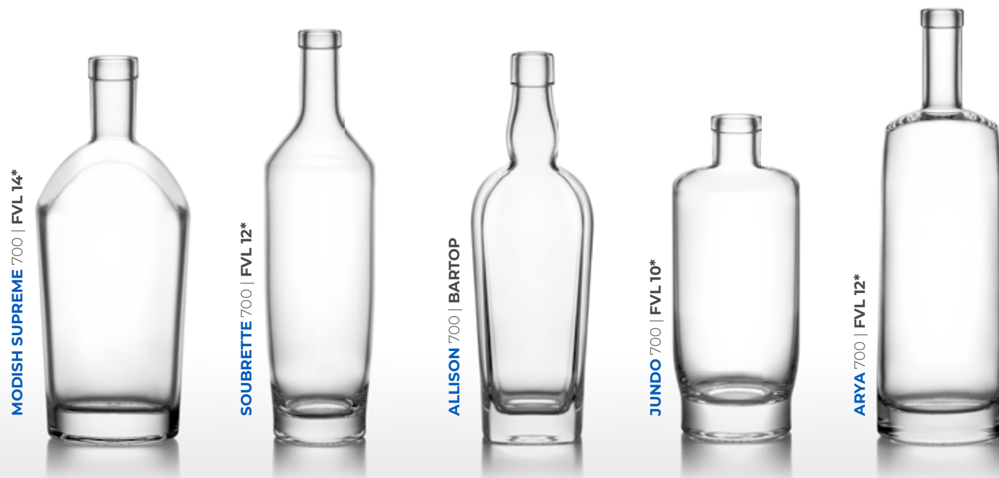
MODISH SUPREME 700 | FVL 14*

The Super Premium line offers a collection of bottles with a functional design, where aesthetics achieve perfect harmony in dialogue with the rationale of use thanks to shapes and designs that find a balance between tradition and innovation.