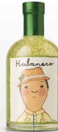
NOCTURNE | 500 ML

EN Berlin Packaging is a leading supplier of premium and specialty glass packaging for the spirits, wine, food, gourmet and home fragrances market. The company offers 3,000+ custom-designed products along with popular standard items . And with a world-class design team, a network of high-quality manufacturers, and a culture dedicated to service, we are ready to help you meet your exact needs. We will make your packaging unforgettable!