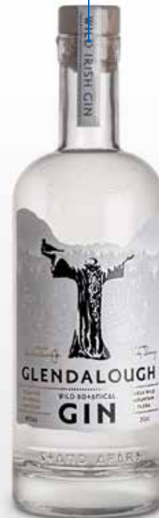
ASPECT | 700 ML