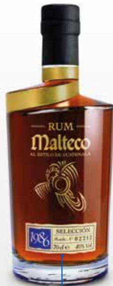
DECANTER 540 | 700 ML