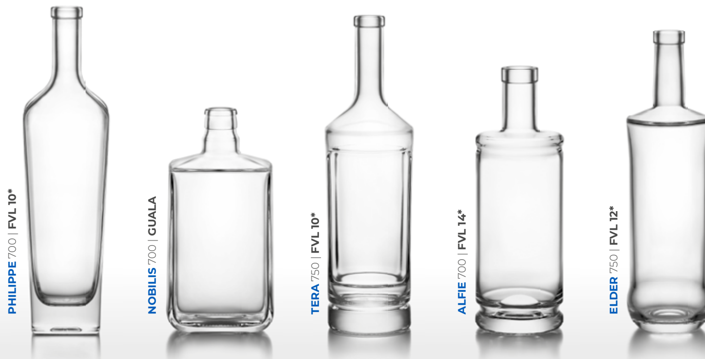
PHILIPPE 700 | FVL 10*

The Premium line presents a selection of bottles linked to the versatility of their design intended for a vast range of products and characterised by harmonious shapes capable of arousing awe and wonder.