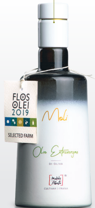
PRIMULA | 500 ML