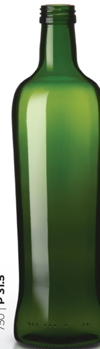
750 | P 31.5