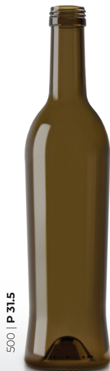
500 | P 31.5