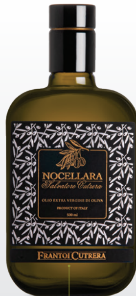
MORESCA | 500 ML