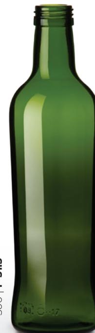
500 | P 31.5