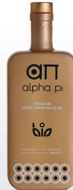
GARDI | 500 ML

EN Berlin Packaging is a leading supplier of premium and specialty glass packaging for the spirits, wine, food, gourmet and home fragrances market. The company offers 3,000+ custom-designed products along with popular standard items . And with a world-class design team, a network of high-quality manufacturers, and a culture dedicated to service, we are ready to help you meet your exact needs. We will make your packaging unforgettable!