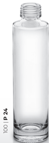
100 | P 24