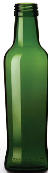
250 | P 31.5