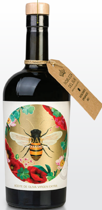
REGINE | 500 ML