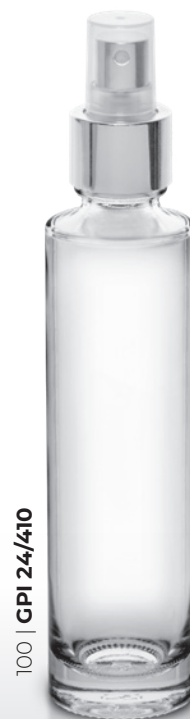
100 | GPI 24/410