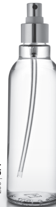
200 | GPI