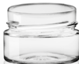
119 | T66 DEEP