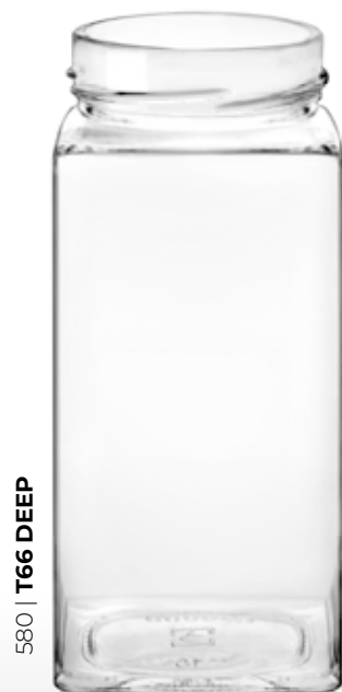
580 | T66 DEEP