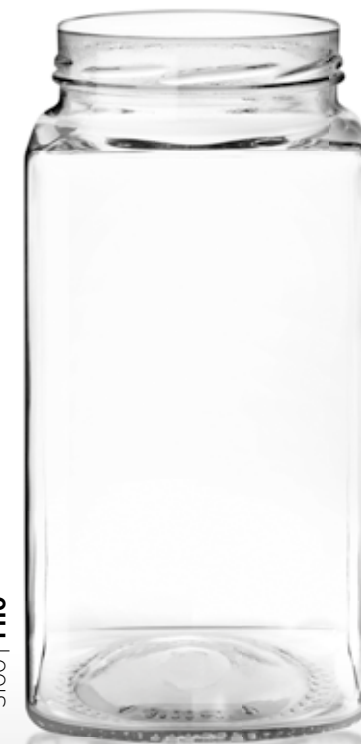
3100 | T110