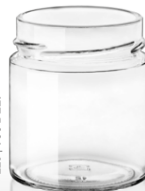
225 | T66 DEEP