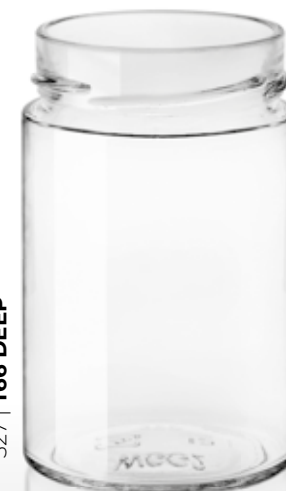
327 | T66 DEEP