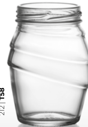
212 | T58

Design by Benjamin Hein Burg Giebichenstein - Halle