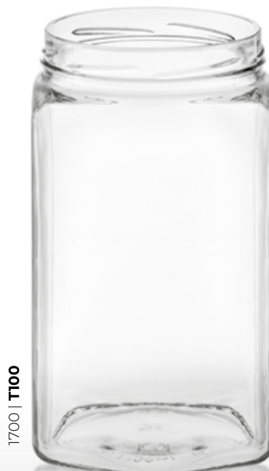
1700 | T100