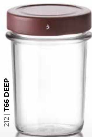
212 | T66 DEEP