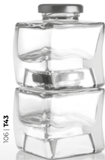
106 | T43