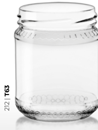
212 | T63