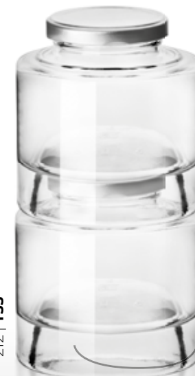
212 | T53