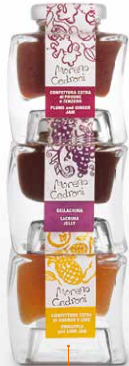
ONDA IMPILABILE | 106