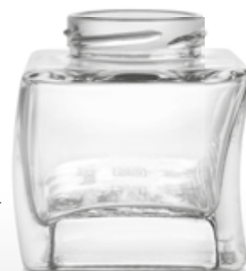
212 | T53